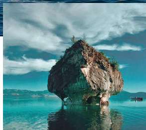
Capillas de Mármol Lago General Carrera