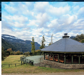
Reserva Ecológica Parque Aikén del Sur