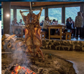
Quincho Parque Aikén del Sur